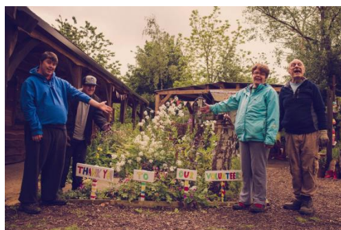
Our Volunteer Thank You

We would like to welcome our new volunteers and extend our thanks for the continued support of more seasoned volunteers – they are all fantastic and greatly appreciated.