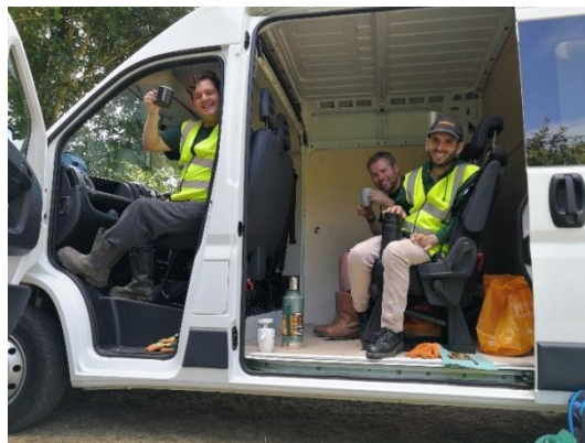
Earthworks on Wheels!

The project will enhance the Earthworkers' experience, with the added benefit of addressing loneliness and isolation in our community. We will pilot the scheme before applying for a grant to fund the ongoing project.