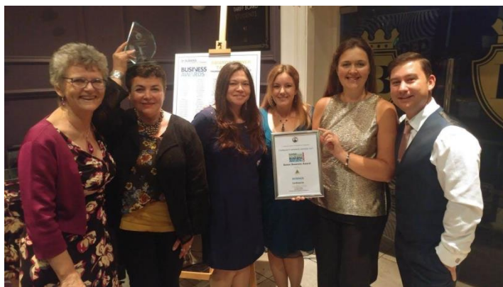
St Albans Chamber of Commerce 'Green Business Award'

Earthworks hosted groups of students with learning disabilities from Oaklands College in St Albans. Classes attended one session weekly as a form of community work experience and skills development. Another, smaller group of students attended Earthworks as part of a supported internship course. Earthworks plans to continue hosting such groups where resources allow.