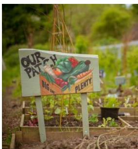
Dig for Plenty

The Hear My Voice project, funded by St Albans City and District Council, has allowed Earthworkers to use digital technology to communicate, develop skills and create photo and video content, presenting their experiences to the wider community.